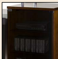
Smoked glass cabinet doors