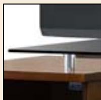
Elevated glass top