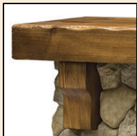
Hand-hewn pine mantel

Capture the feel of a private retreat! This simply stunning new mantel recreates the rustic charm of a woodland retreat with the life-like look of natural stone and hand-hewn pine.