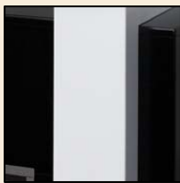
Bold pilaster design