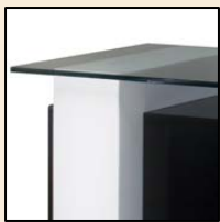
Tempered glass top

Make a bold statement! The Bella turns heads with a striking black and white finish and tempered glass top.