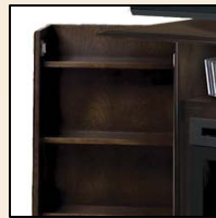
Opening storage cabinets